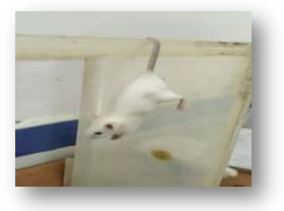
Fig.8 Tail suspension test

Mice were considered immobile when hung passively and remain motionless.