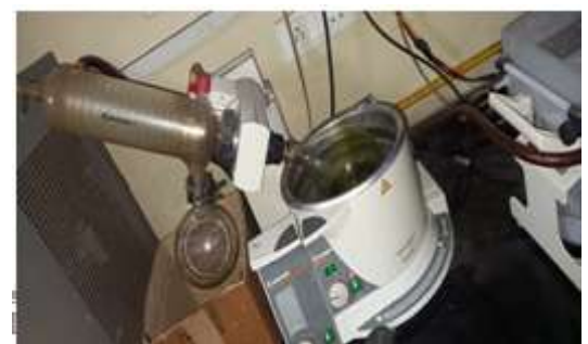
Fig.6 Recovery of the solvent by Rota Evaporator

% yield = weight of the obtained dried extract / weight of the plant materialX 100.