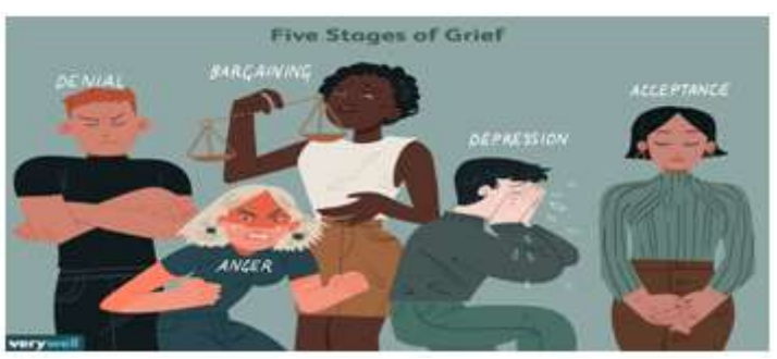
Fig.1 grief of depression

Loneliness and isolation: Loneliness and isolation can make a person feel lonely and isolated, making it hard for them to build and sustain meaningful relationships with others. The goal of IPT is to help