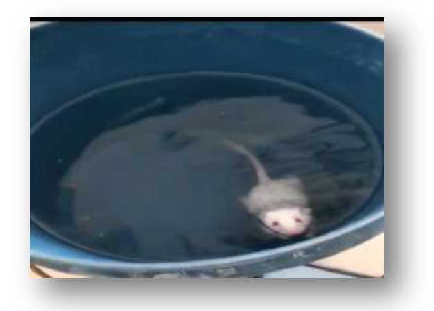
Fig. 6 experimental behaviour of mice in forced swimming test