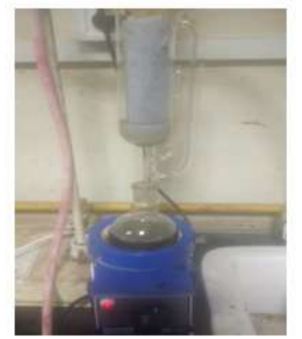
Fig 6 soxhelation process

SOXHELT EXTRACTION: In this procedure, approximately 40g of previously air-dried and coarsely pulverized Limoniaacidissimalinn powder serves as the sample, placed within a thimble. Onefourth of the round bottom flask (RBF) is filled with ethanol, and porcelain chips are introduced to prevent bumping. The entire apparatus is assembled, with a heating mantle employed to heat the RBF. As the heating progresses, the siphon initiates overflow due to gravity, and the spilled liquid returns to the RBF through direct linkage. This marks the commencement of the first cycle. Subsequently, the product collected in the round bottom flask is processed. The process described can be iterated numerous times over the course of hours or days until the colour of the solvent diminishes in the siphon tube. Subsequently, the solvent is drawn back into the round bottom flask for the evaporation process.